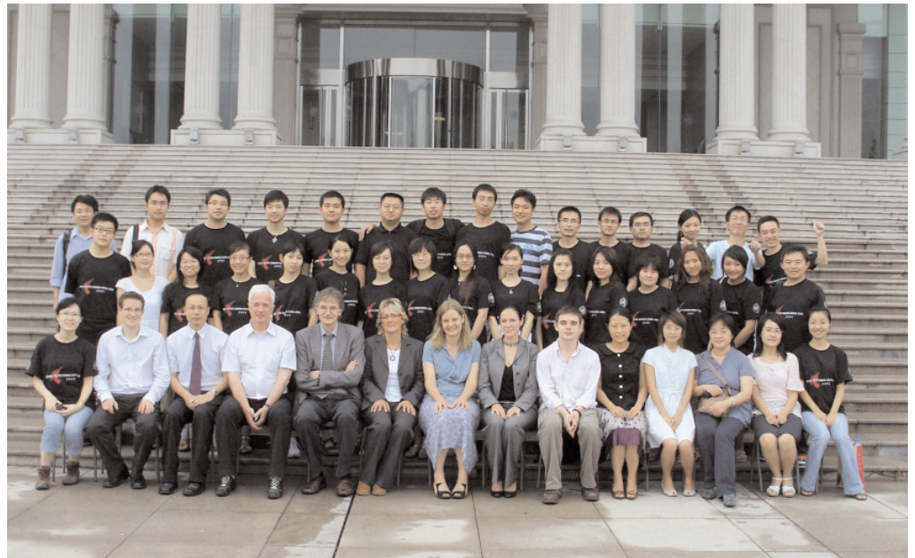
The participants of GP Summer School China in front of Fudan's main building.