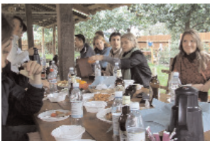
Picnick in the little picturesque village of Minge close to Nida.