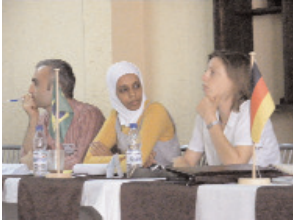
Simulation of the UN Security Council meeting.

In July 2008, the Center for Global Politics (CGP) at Freie Universität Berlin and Arab International University (AIU) conducted the joint Global Politics Summer School Syria 2008 in Syria's capital Damascus. The 10-day summer school was the very first joint German-Syrian educational project in the field of international relations. In the beginning the project had to overcome several administrative and political obstacles before finally being successfully implemented.