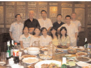
Meeting in Beijing - the regional alumni groups are very active.