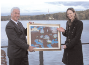
At the graduation of the third run.