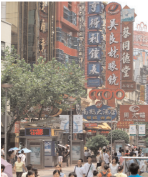
The Summer School China takes place in Shanghai over a period of two weeks.