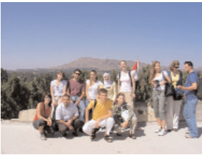
This is the group of the first joint Syrian-German Summer School taking place in Damaskus.