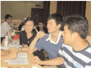
Students taking part in the project module class.

Choosing this topic reflects our belief that environmental issues are at the forefront of global challenges and that these can only be resolved through international cooperation. This part of the program familiarized students with key concepts, actors, and instruments in environmental policy. Special attention was also given to a comparative perspective, addressing the policy approaches of China and Europe and drawing conclusions for the prospects of future cooperation on selected issues. Hence, we were particularly happy to welcome two new lecturers on board, both of whom are experts in the field: Prof. Miranda Schreurs, director of the Environmental Policy Research Centre at Freie Universität Berlin, and Prof. Bo Yan of the School of International Relations and Public Affairs (SIRPA) at Fudan University.