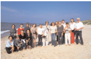
The fifteen participants of CGP alumni group in Nida.

Close to the Russian border lies the little town of Nida in Lithuania where the CGP first alumni workshop took place. (map: http://www.kalnovila.lt/ )