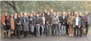
EES Online's students from the sixth run.