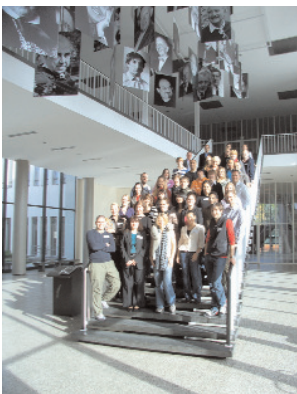
The IR Online students during the in-house class in Berlin, October 2008.

Agnes Bodens is the new project coordinator for IR Online. She started in September 2008.