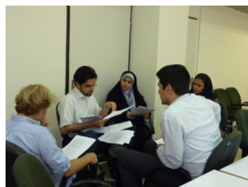
Working Group at Summer School Iran 2010