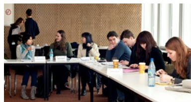
EES Online students during the in-house weeks at Freie Universität Berlin in March, 2011.