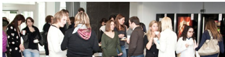
Students from the 4 th and 5 th run of the IR Online Master's program are meeting once again during the in-house class in March 2011.

In the technical sector, IR Online is proud to present its Facebook page at http://de-de.facebook.com/pages/MA-International-Relations-Online/125832610796422 . Become a fan and join us in exchanging news and stories about and beyond the program! We hope to provide our students with novel features and offers throughout the year – and we are always keen to implement innovative and cutting-edge ideas.