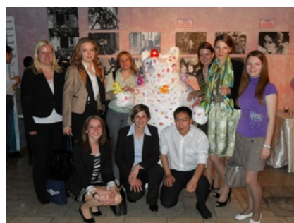
GSR Unites! Alumni Meeting in Moscow, May 2011

GSR's alumni network continues to bring together former and current students that all share a strong professional and personal interest in Germany. Enjoying their time together is as important to our members as discussing professional topics. In addition to the two major alumni events offered by the Center for Global Politics every year, more and more activities are started by the alumni themselves. GSR definitely unites!