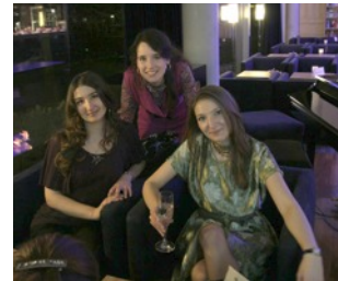
Meeting old friends and making new ones.