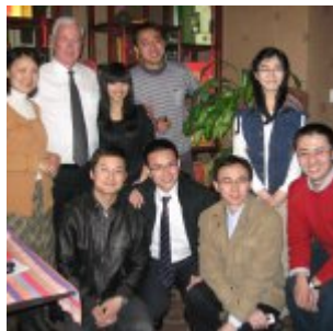
CGP alumni meetings in Shanghai and Beijing in March 2011.