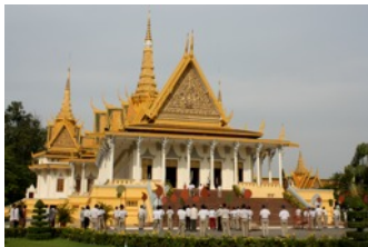
The Royal Palace Museum in Phnom Penh.

The other Seasonal Schools this year will take place in politically rather turbulent places: a Summer School in Amman (September), a Fall School in Tehran (October) and a Greek-Turkish Fall School in Athens (November).