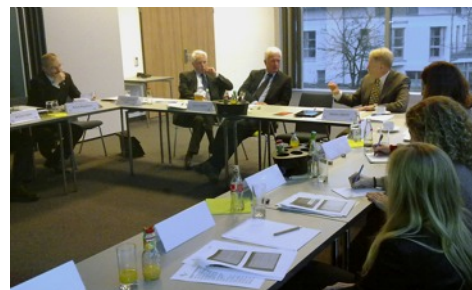
On February 2, 2011 the CGP advisory board met for the first in Berlin.