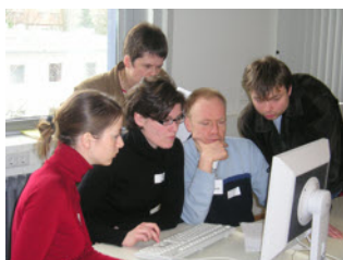
Introduction to e-learning during the In-House Classes.