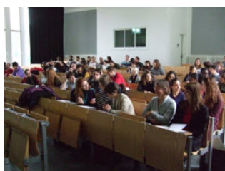
Our first Career Day for the EES Online students.