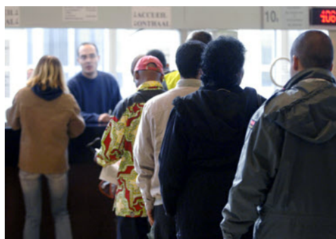
Today's large scale immigration is a great challenge for Europe.

The cases; Berlin, Stockholm, Oslo, Vienna, Paris and Copenhagen; were selected due to their variation on the independent variables. For the last four cases the author collected previously unknown data on the composition of their city councils with respect to the presence of immigrants. A comparison of the six cases concludes that all three independent variables affect the dependent variable while the right to vote has the strongest effect.