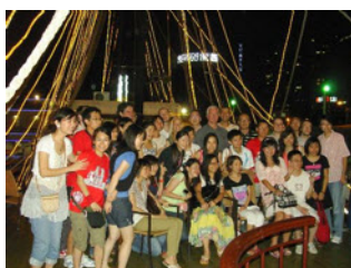
Summer School China participants on a boat trip.

During two intensive weeks, the analytical focus will shift from the global to the local realm. In addition to established modules on global politics, there will be a panel discussion with journalists, foreign correspondents, and bloggers addressing the impact of New Media on politics and societies in China, Europe and beyond.