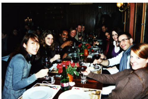
At the end of the week at the farewell dinner in Berlin.