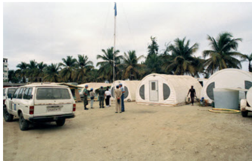
Securing peace in Angola – UN election observation.

Though some of the evidence remains inconclusive, the empirical analysis suggests that both factors improve the chances that parties in conflict lay down their arms and that these effects are mutually reinforcing.