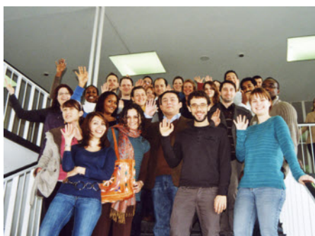
The IR Online students during the In-House classes in March.

By emphasizing both curricula development as well as academic and applied research skills, IR Online seeks to further strengthen the combination of flexible and high-quality online teaching with on-site coaching in specific skill areas. This combination allows the program to be an excellent stepping stone for young professionals.