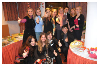
Alumni from the sixth GSR run together with their tutors.