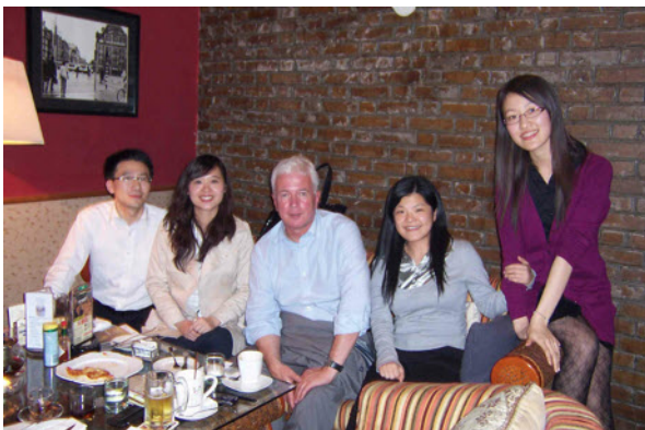
Regular alumni meetings are taking place in many countries across the world. Here for example in China in March 2010; Beijing, Shanghai and Guangzhou.