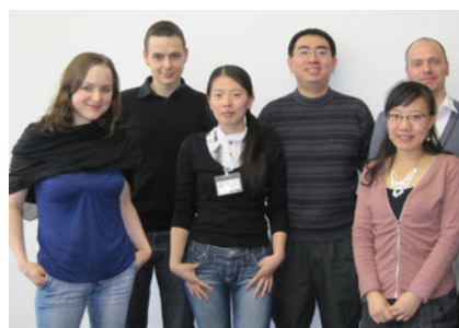
The PhD students of the second run during the intensive seminar at Freie Universität Berlin in March 2010.

If you are interested in applying, or have any questions, please contact phd@global-politics.org .